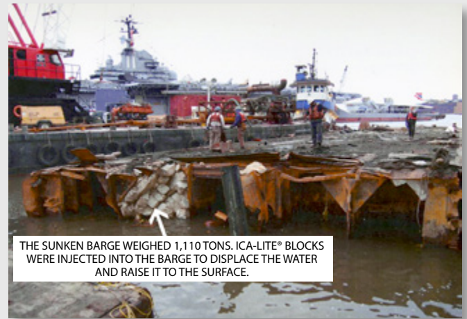
THE SUNKEN BARGE WEIGHED 1,110 TONS. ICA-LITE® BLOCKS WERE INJECTED INTO THE BARGE TO DISPLACE THE WATER AND RAISE IT TO THE SURFACE.

or sawing tools. ICA-LITE EPS is subject to deterioration when exposed to gasoline, most petroleum solvents and resinous products used in fabricating reinforced plastics.